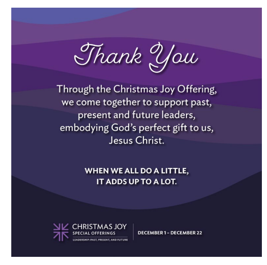
December 22 | Christmas Joy Offering